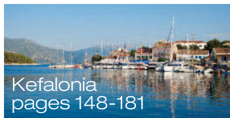
Kefalonia pages 148-181

Ithaca has remained untouched by tourism because, like Paxos, it has no airport and can only be reached by ferry from neighbouring islands or the mainland. A holiday in Ithaca is for those who seek a relaxed break in a friendly environment.