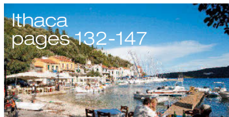
Ithaca pages 132-147

Together with our sister company Survil Holidays we have one of the largest selections of accommodation in Greece and Cyprus to suit all tastes and budgets. The bride and groom may want to stay in one of our private villas (some of which can also host the reception) or a deluxe hotel, whereas some wedding guests may only want studio accommodation. Whatever the budget, we are ideally placed to provide the full package.